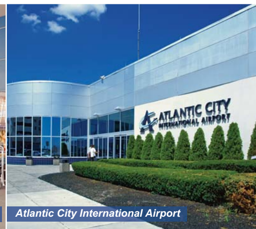
Atlantic City International Airport