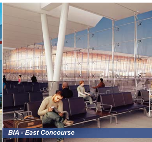
BIA - East Concourse