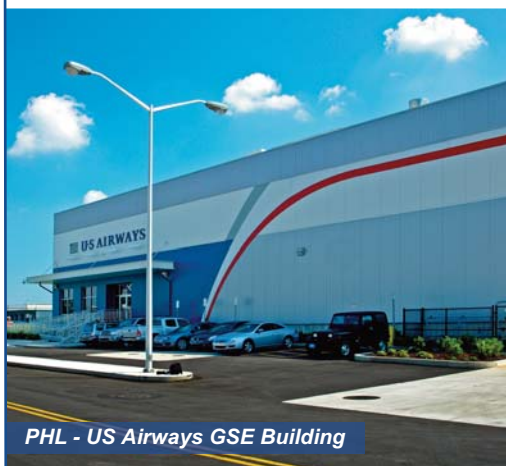
PHL - US Airways GSE Building