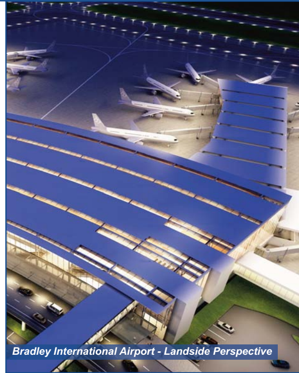
Bradley International Airport - Landside Perspective

We believe airports provide a direct link to the economic growth of a community and metropolitan area. We listen to our client’s needs and apply our experience, knowledge, and innovative thinking to turn ideas into reality.