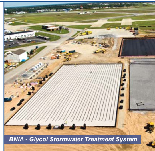
BNIA - Glycol Stormwater Treatment System